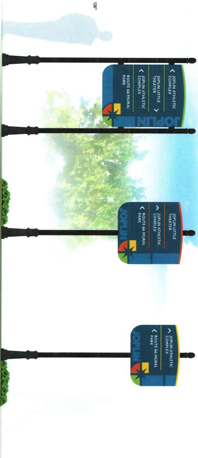
1 FRONT VIEW 3.9 SCALE: 1/2" = 1'-0"