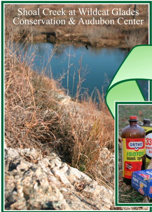
Shoal Creek at Wildcat Glades Conservation & Audubon Center