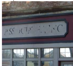
Vinyl lettering is not allowed; due to its lack of longevity.