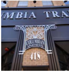
Signage at Columbia Traders, downtown Joplin.